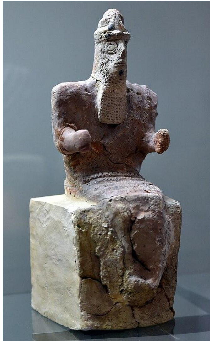
Statuette of Enlil sitting on his throne from the site of Nippur , dated to 1800–1600 BC, now on display in the Iraq Museum