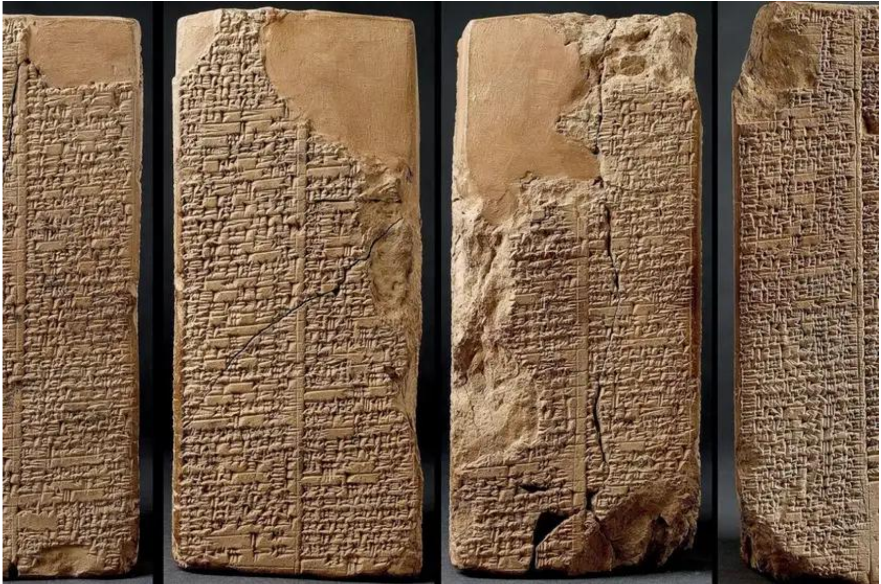
The Enuma Elish (Seven Tablets of Creation)