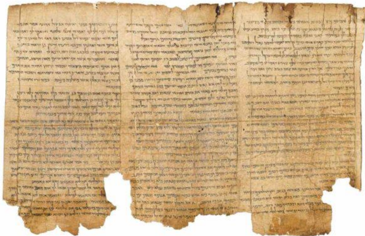
Dead Sea Scrolls