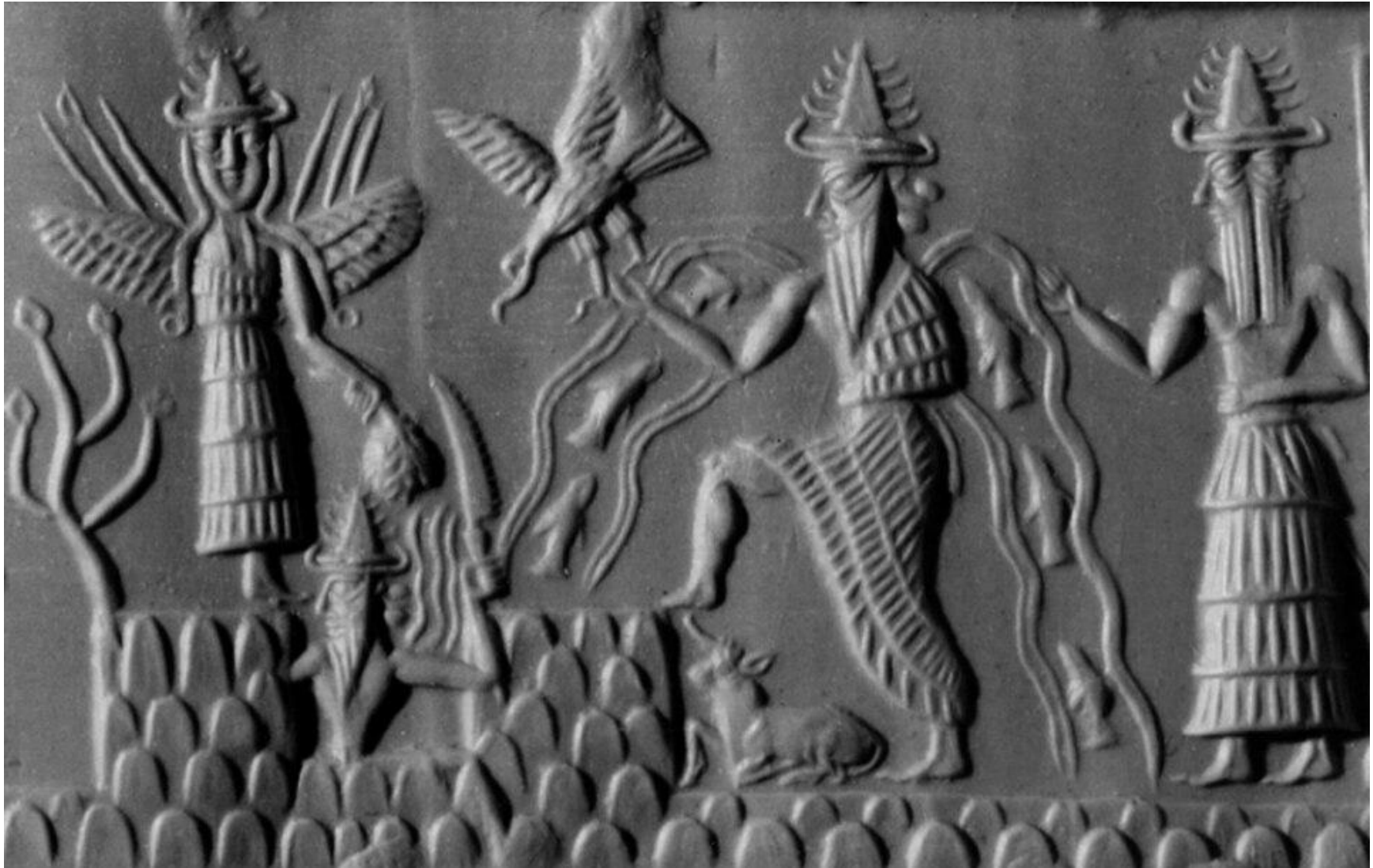
Akkadian cylinder seal dating to c. 2300 BC, depicting the deities Inanna , Utu , Enki , and Isimud