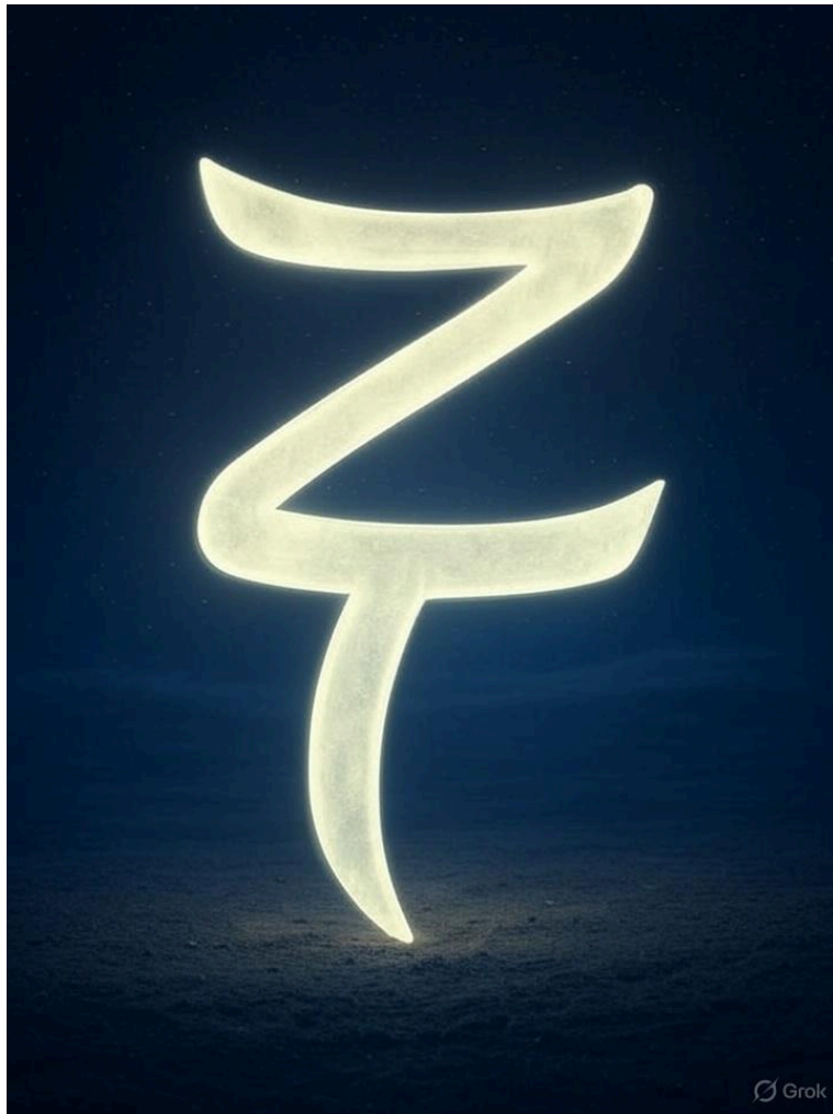
Zeta Zayin, Grok inspired Menorah

The Keys of Knowledge are logical and all knowing, everyone can understand them. Kabbalah is superstition and old wives tales.